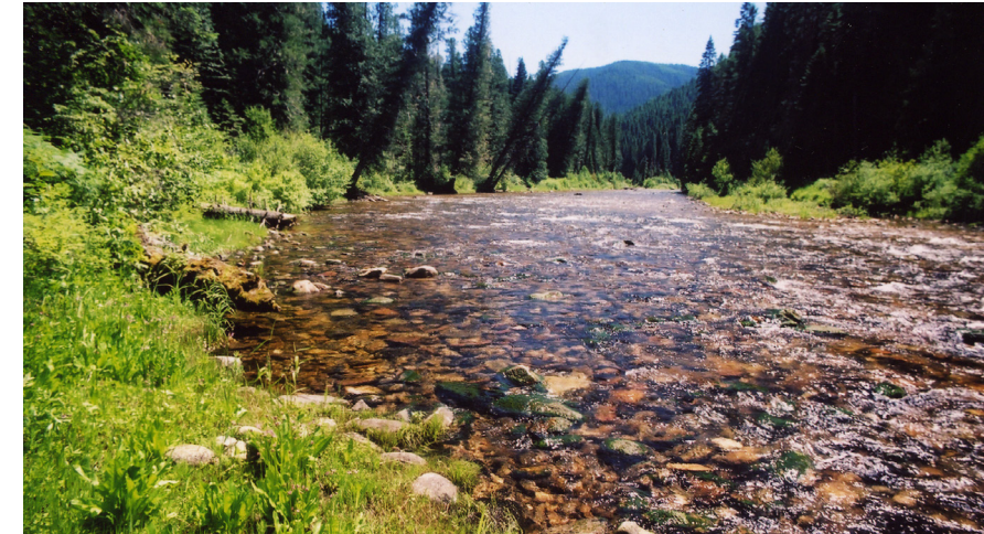
Weitas Creek roadless area needs your voice

threatened and endangered species, including bull trout, Chinook salmon, west-slope cutthroat trout, lynx, fisher, grizzly bear (extremely rare), and others. It is also famous for its elk herds and numerous other species, such as wolves, wolverines, black