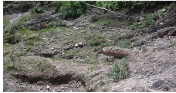
This photo was taken by the Flathead National Forest of its logging road 10753. It considers this road so well "stored" and "impassable" to motor vehicles that it need not be counted as a road in total road density - as though it does not continue to impact fish and wildlife!

All this is occurring in grizzly bear habitat and largely in bull trout habitat. It demonstrates a clear rever-