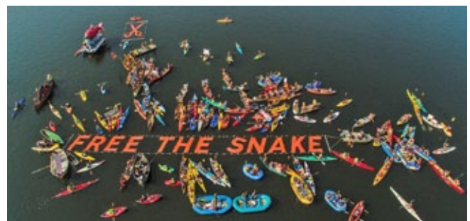
The first Free the Snake Flotilla October 2015