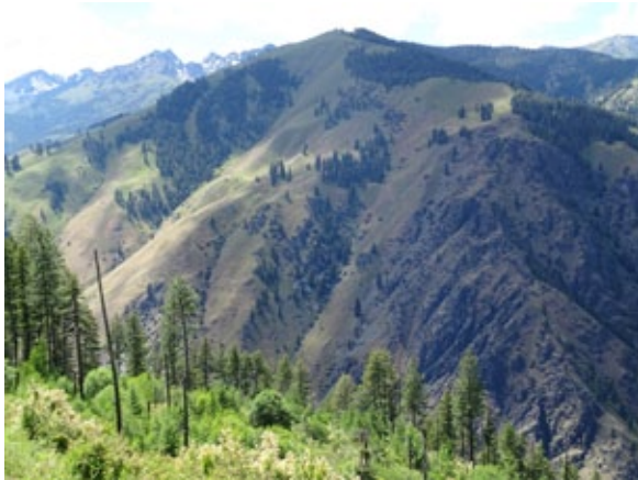
Looking into the Rapid River canyon near the Windy Shingle Timber Sale area

On sadder news, we lost our appeal on the Windy Shingle Timber Sale in the Ninth Circuit. We are very grateful to the Friends of the Rapid River for being the lead plaintiff and for their financial support of the lawsuit. We are sad to lose