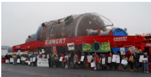
Megaload protest at the Port of Lewiston January 2011

In 2010, FOC learned about the severe threats that megaload shipments posed to the Middle Fork Clearwater and Lochsa Wild & Scenic River corridors. The Idaho Transportation Department was planning to convert the two-lane Highway 12 into a permanent high-wide industrial corridor for ExxonMobil and other oil corporations to use to get their equipment to the apocalyptic Alberta Tar Sands. A broad coalition of citizens, conservation groups, attorneys, and the Nez Perce Tribe eventually defeated the state of Idaho and Big Oil through an injunction in federal court. Years of attending public meetings, writing letters to the newspaper, organizing citizen protests, and developing a thorough highway monitoring program (in the middle of night) came to fruition. We collectively saved one of the truly great river corridors in America from becoming a tentacle to one of the most destructive projects on the planet.