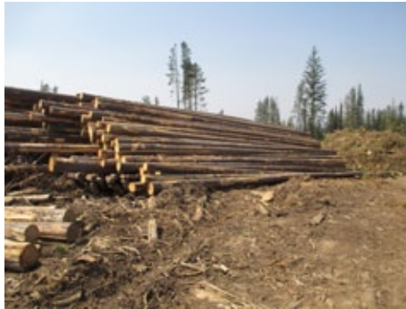
Iron Mountain Timber Sale

can burn lightly (or not at all), burn at a moderate level, or burn with high severity. That last type, the high-severity, can be large or small, but occurs less frequently. Scientific evidence demonstrates that the two most effective measures that homeowners (who have assumed the risk of living next to national forests) can take is on their own property. The Forest Service’s own scientist, Jack Cohen, conducted research and found home ignitions were unlikely unless there are flames or ignitions within 40 meters of the home. This means clearing vegetation that can ignite within 40 meters of the house, and it means installing a non-flammable roof so that firebrands (i.e., a piece of burning wood carried by the airstream) will not land on a roof and ignite the house. Other measures that can reduce a home’s ignitability from inevitable firebrands is vent screening, firewood placement, keeping nooks and crannies free of debris, and placing propane and gas tanks away from the house. In the Journal of Forestry, Cohen states, “Homes with low ignitability can survive high-intensity wildfires, whereas highly ignitable homes can be destroyed during lower-intensity fires.”