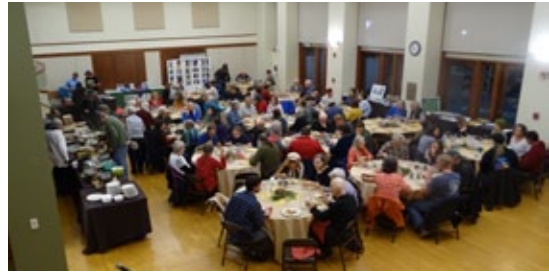
Annual Meeting & Gathering November 2019