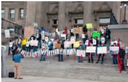
Wolf-killing protest at the Idaho State Capitol Building Spring 2016

When the Northern Rockies gray wolf population was wrongfully stripped of protections afforded under the Endangered Species Act in 2011 by a rider attached to a must-pass Congressional spending bill, our battle to protect gray wolves from state-sanctioned hunting and trapping seasons, and government-aerial gunners began. Since then, we have attended numerous Idaho Fish & Game meetings, submitted countless public comments to the agency, and helped organize multiple protests throughout Idaho. We have also joined lawsuits with other conservation groups (see page 8) when possible. We will continue to defend wolves as long as they are ruthlessly killed and prevented from fulfilling their crucial ecological niche in the Clearwater.